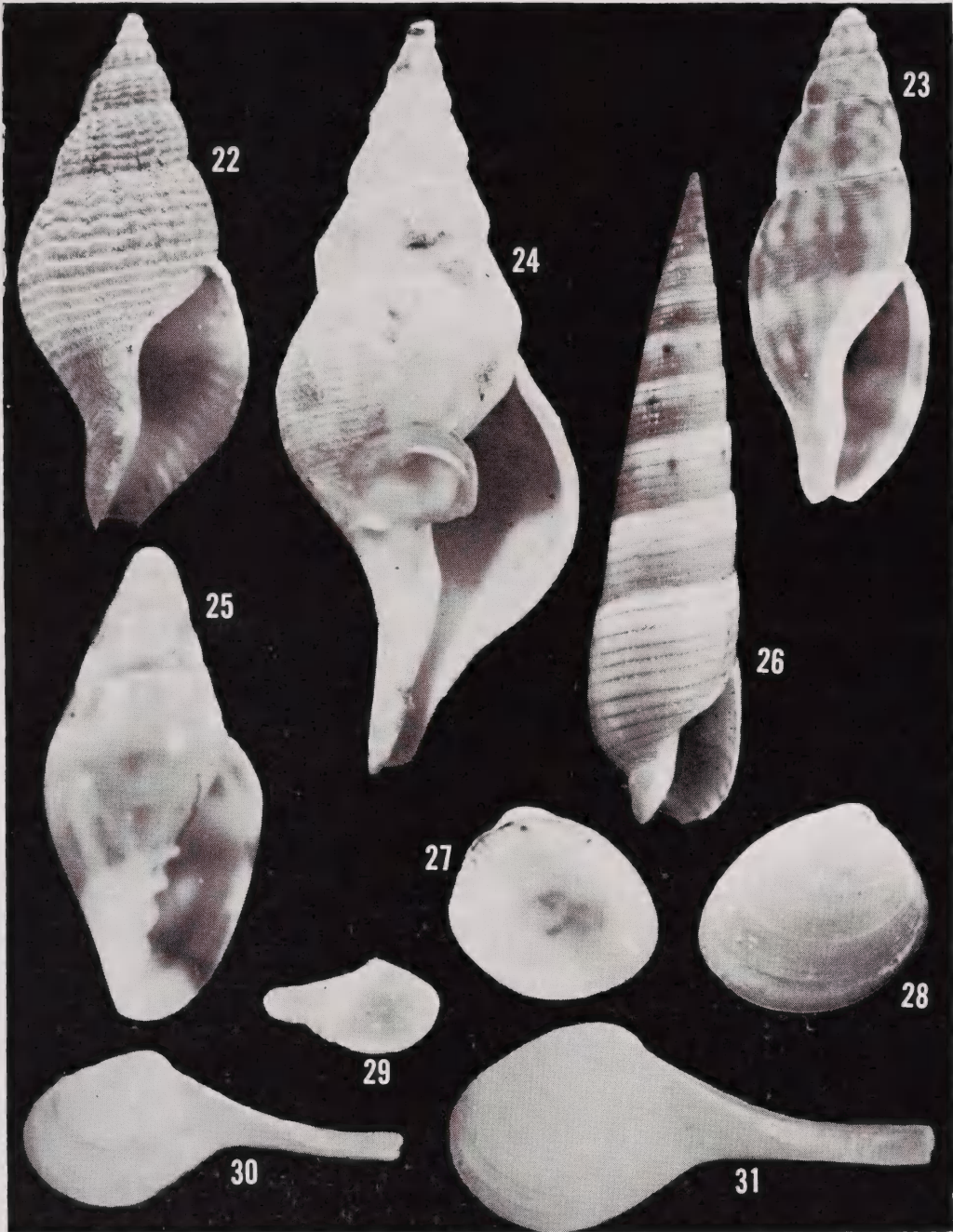
Figs. 22-31. 22. Cantharus aldermenensis Powell, sp. n. Holotype, Auck. Inst. Mus., 16.0 x 7.0mm, east of Aldermen Islands, 366-475m. 23. Ratifusus adjunctus Iredale, E.S.E. of Poor Knights Islands, 329m, 19.0 x 7.0mm. 24. Penion benthicola delli Powell, subsp. n. Holotype, Auck. Inst. Mus., 83.5 x 32.0mm. E.N.E. of Poor Knights Islands, 366-475m. 25. Marginella (Volvarinella) wormaldi Powell, sp. n. Holotype, Auck. Inst. Mus., 9.3 x 4.25mm. E.N.E. of Poor Knights Islands, 293-439m. 26. Terebra circumcincta Deshayes, dredged, shallow water, Bay of Islands, 31.75 x 7.6mm. 27, 28. Nucula nitidulaformis Powell, sp. n. Holotype, Auck. Inst. Mus., 4.4 x 4.0-4.5 x 2.75mm, east of Aldermen Islands, 366-475m. 29-31. Cuspidaria fairchildi Suter. 29. Off Mayor Island, 175m, 19.0 x 8.75mm. 30, 31. Off Aldermen Islands, 366-439m. 30. 47.5 x 20.0mm. 31. 67.0 x 27.0mm.